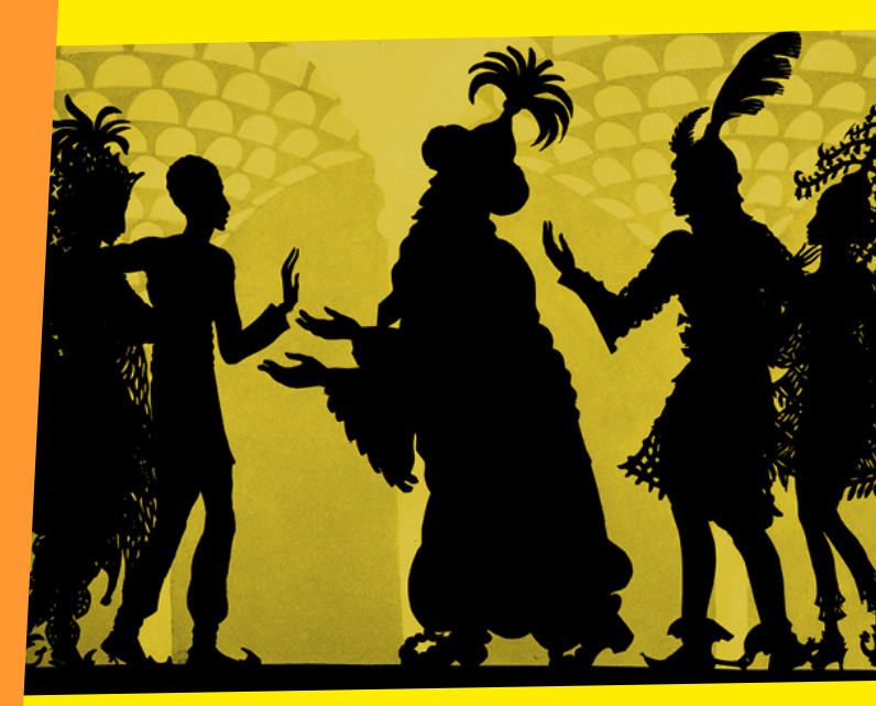
Still from Lotte Reiniger's 'The Adventures of Prince Achmed'

Today, a huge range of materials are used in stop-motion animation and many Animators make use of rubbish and waste materials in their work.