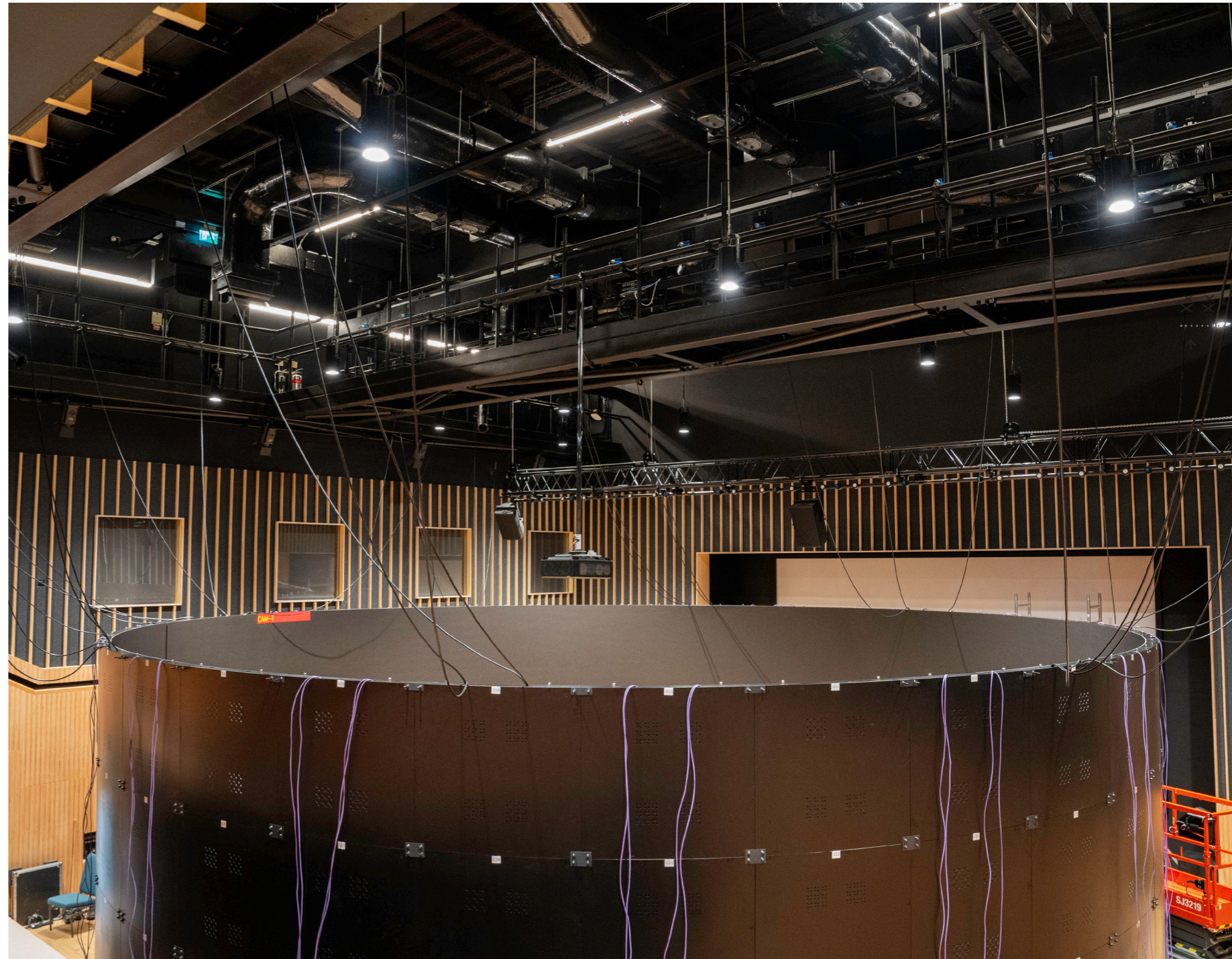
→ Tiggy Pretty 2023