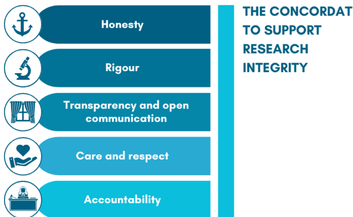
Figure 1: Infographic illustrating the five principles of The Concordat to Support Research Integrity.

These five principles are listed below with some examples of how they may be evidenced in research environments. The research community is expected to apply these principles as necessary and appropriately to their roles and responsibilities.