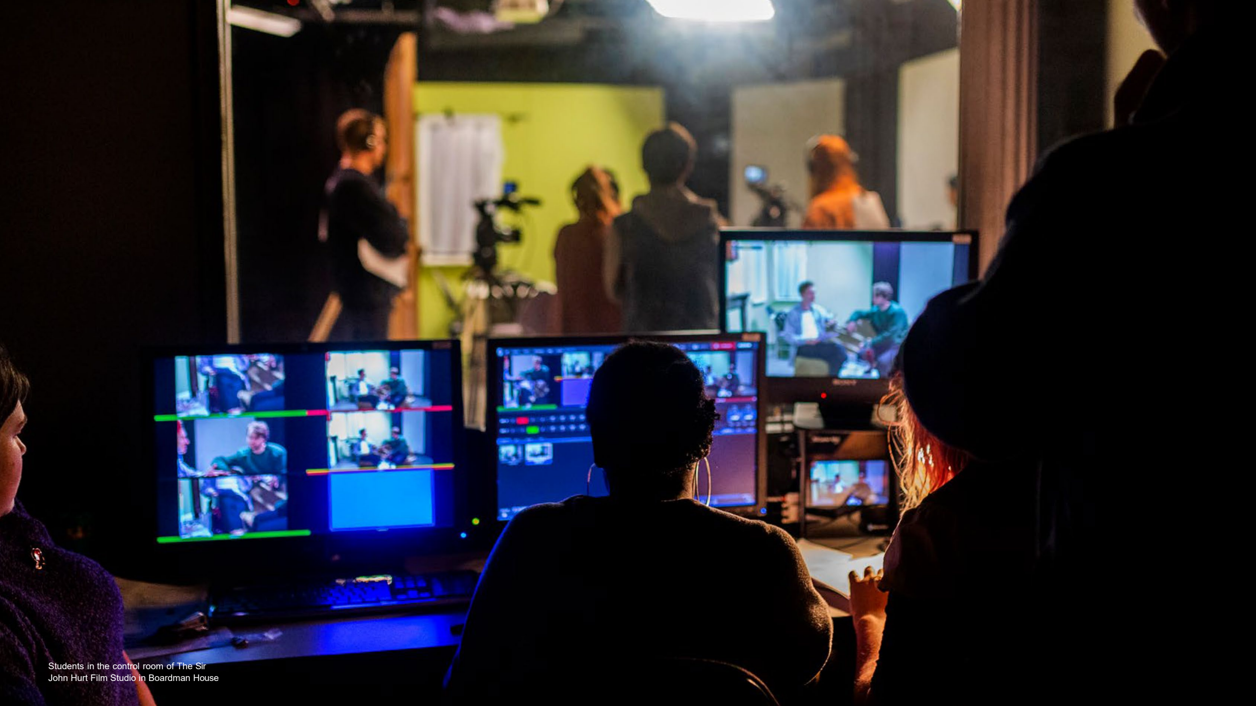
Students in the control room of The Sir John Hurt Film Studio in Boardman House