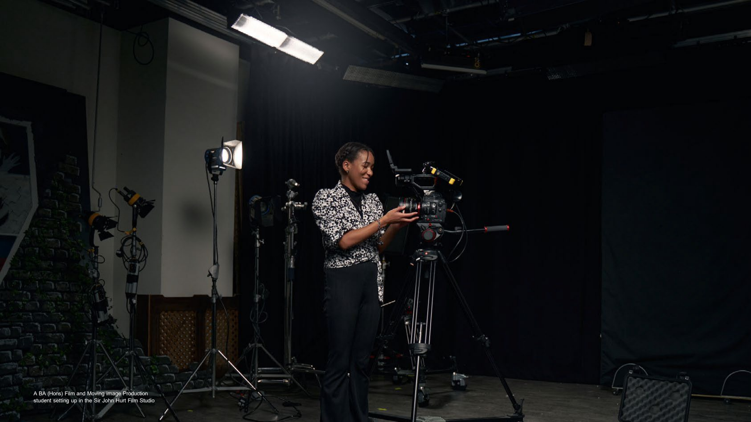
A BA (Hons) Film and Moving image Production student setting up in the Sir John Hurt Film Studio