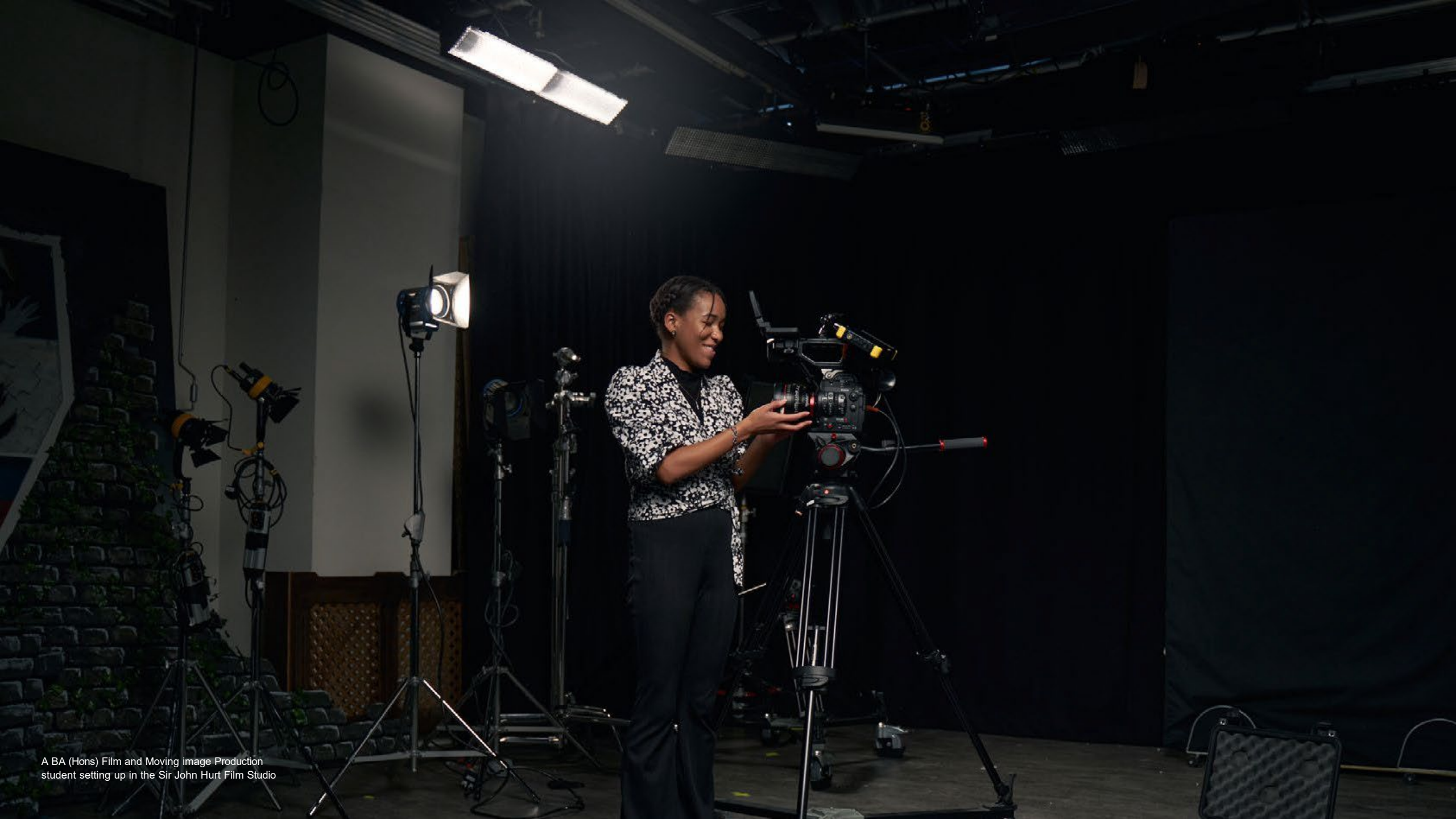
A BA (Hons) Film and Moving image Production student setting up in the Sir John Hurt Film Studio